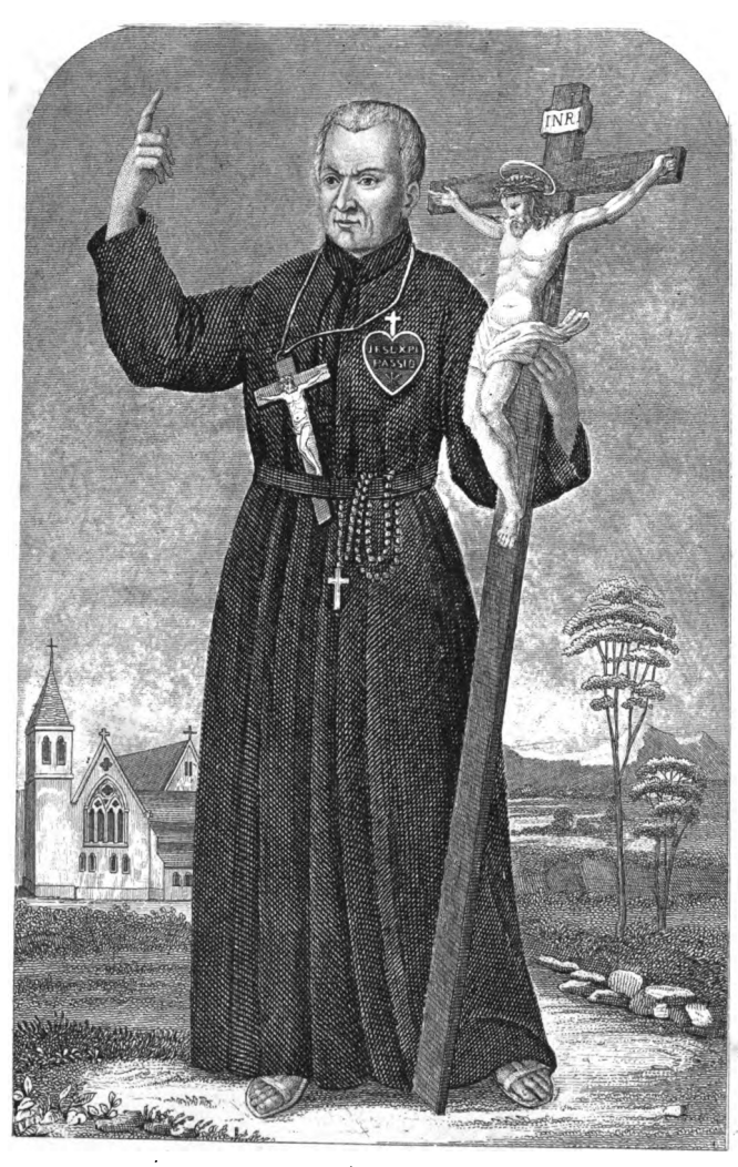
Blessed Paul of the Cross,