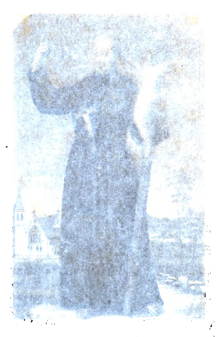
مددد بهر المنافذة لمؤلفة